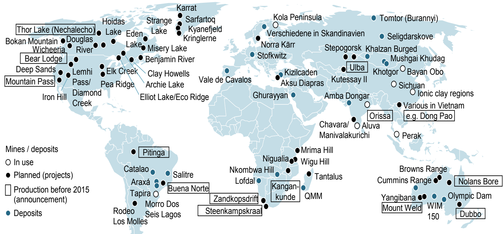
World Wide Deposit activity (Selected RE mines/deposits 2011)